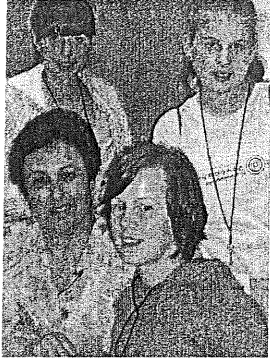
Students with Sherin Ebadi